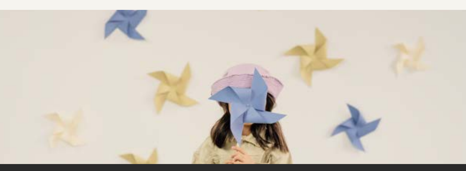
School Age Camp Parent Handbook - Page 14

Campers must wear simple, non-restrictive clothes. Please have your child wear clothes that can get muddy, stained, and possibly ruined. Have your child dress appropriately for the weather. We will go outside even when it is chilly. Sneakers with non-marking soles shoes are required for gym time. Please have your child wear well-fitting and appropriate shoes. We run, climb, jump, and play organized games throughout the day. Toes get hurt in sandals and flip-flops and neither are appropriate for camp.